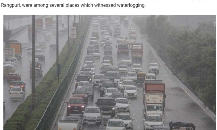
Vehicles ply on Delhi-Gurugram Expressway during rain in Gurugram

Areas like Anand Vihar, Wazirabad, the road stretch between INA and AIIMS, Mehrauli-Badarpur Road, Tughlakabad, Sangam Vihar, Kirari, Rohtak Road, Vikas Marg, near Zakhira, Najafgarh, Mahipalpur, and Rangpuri, were among several places which witnessed waterlogging.