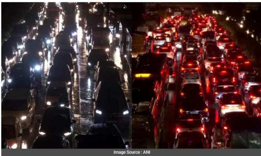
Traffic snarl in various parts of the national capital following continuous rainfall in the city.