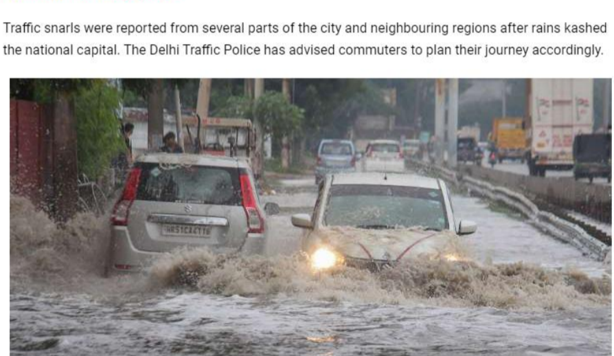
Vehicles wade through the waterlogged Delhi-Gurugram Expressway service road after heavy rains in Gurugram.

Traffic snarls were reported from several parts of the city and neighbouring regions after rains lashed the national capital. The Delhi Traffic Police has advised commuters to plan their journey accordingly.