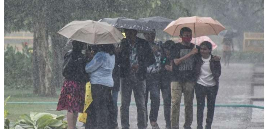
Pedestrians walk during rain, at Kartavya Path in New Delhi on Saturday morning.