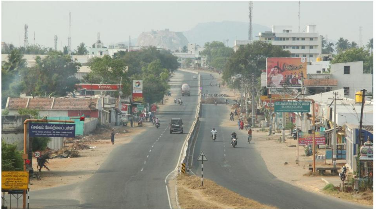
Representational image. File photo

The State government has awarded the task of preparation of master plans for 42 towns to four consultants under the Union government's scheme of Amrut 2.0.